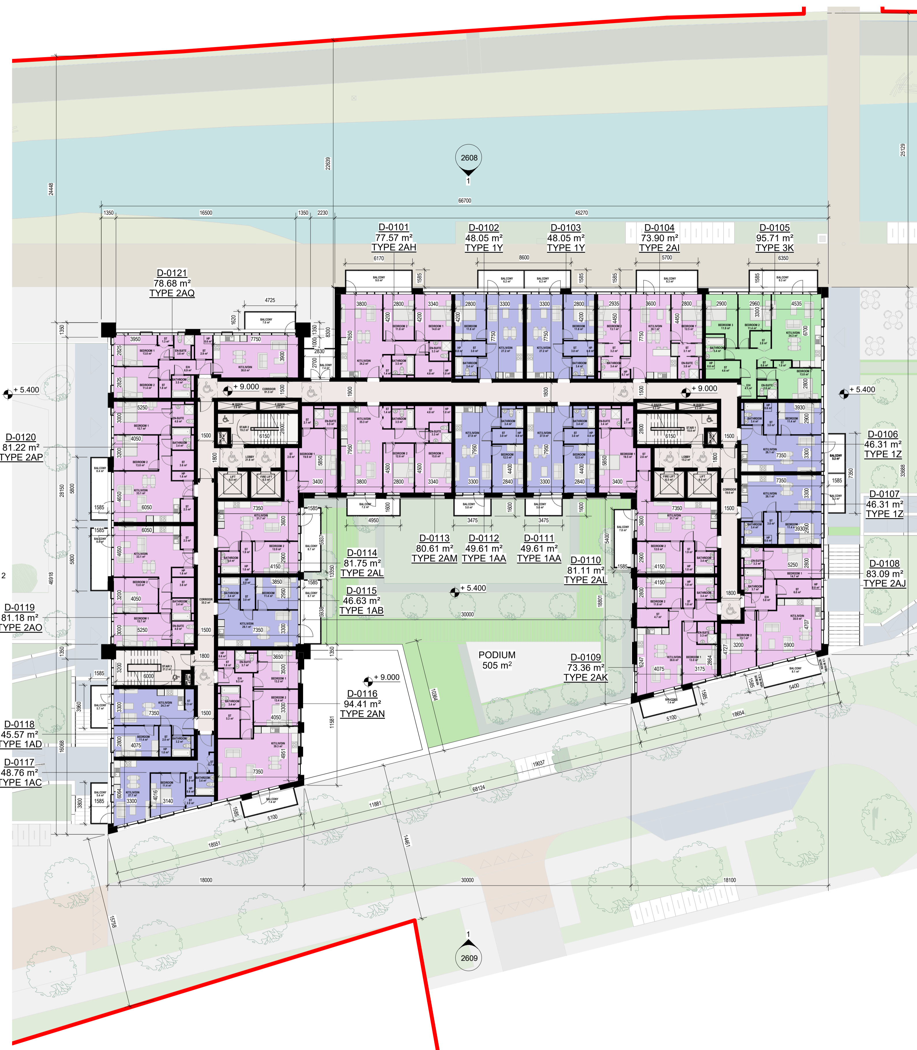
Accommodation Schedule-BLOCK D_L01

Please consider the environment before printing this sheet